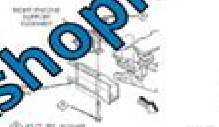
Fig. 27 Engine Mounting—Right Side (Continued)