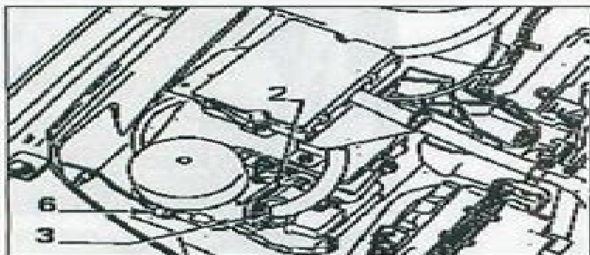
Purga del circuito de frenos. 2. Grupo electrobomba - 3. Tubo de baja presión - 6. Tornillo de expansión del grupo electrobomba.