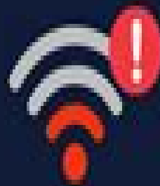
Wrong Wi-Fi Network