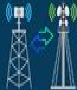
Change Your ISP