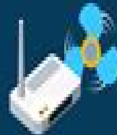
Adequate Ventilation for the Router