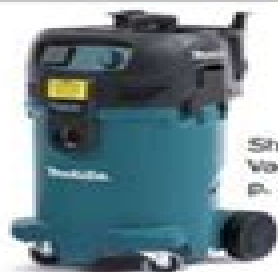
Shop Vacuums, p. 48