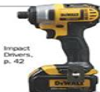
Impact Drivers, p. 42