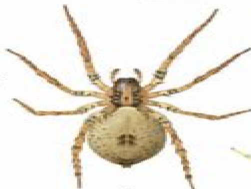
5. Buzzing Spider Anyphaena accentuata ♀ 6 mm