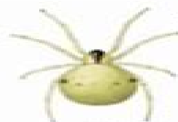
2. Comb-footed Spider Pardiscura pallens 1.5–2 mm