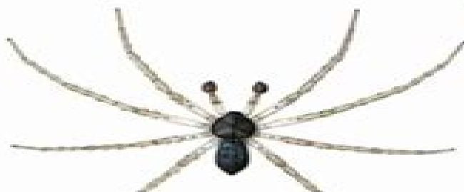
4. Running Crab Spider Philodromus dispar 5 mm