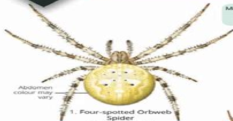
1. Four-spotted Orbweb Spider Araneus quadratus ♀ 12 mm (can go up to 15 mm)

Measurements relate to body length excluding legs