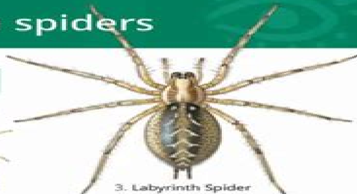
3. Labyrinth Spider Agelena labyrinthica ♀ 12 mm