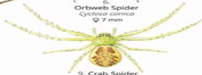
9. Crab Spider Diaea dorsata 6 mm