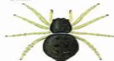
11. Jumping Spider Heliophanus flavipes ♀ 6 mm

Low bushes and vegetation (including flower heads) and foliage of low tree branches