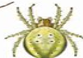
10. Orbweb Spider Araniella cucurbitina ♀ 6 mm