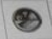
Fig. 2. Fuel Gauge