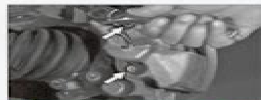
Detailed brake pad and rotor service procedure. 48 Brakes—Mechanical