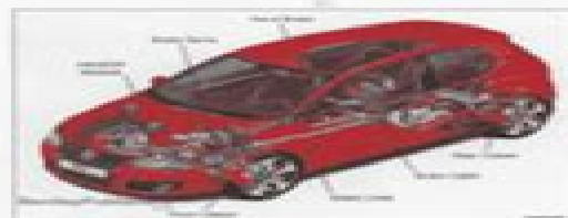
Suspension and brake components of GTI model. 02 Product Familiarization

Service to Volkswagen owners is of top priority to Volkswagen and has always included the continuing development and introduction of new and expanded services. Whether you're a professional or a do-it-yourself Volkswagen owner, this manual will help you understand, care for and repair your Volkswagen. The do-it-yourself Volkswagen owner will find this manual indispensable as a source of detailed maintenance and repair information. Even if you have no intention of working on your vehicle, you will find that reading and owning this manual makes it possible to discuss repairs more intelligently with a professional technician.