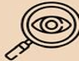
Attention to detail