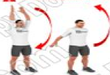
SHOULDERS & UPPER BACK

⚠️ Consult a physician before starting any stretching regime. This chart is for informational purposes only.