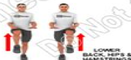
LOWER BACK, HIPs & HAMSTRINGS