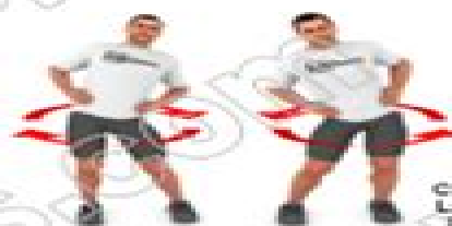
CORE & LOWER BACK