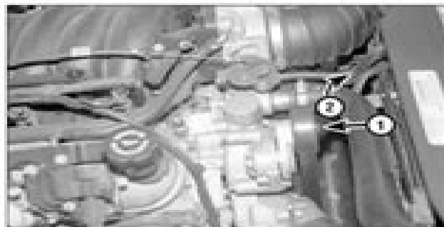
24.11 To remove the drivebelt, rotate the tensioner bolt (1), clockwise (2) to relieve belt tension (2007)