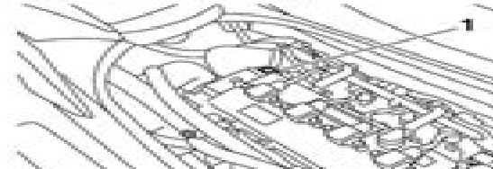
1 Engine serial number location

The engine serial number is stamped on a plate attached to the engine unit. (See page 47 for seat removal and installation procedures and page 89 for engine cover removal and installation procedures.)