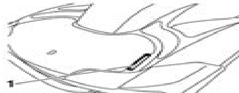
1 Craft Identification Number (CIN) location

The CIN is stamped on a plate attached to the aft deck.