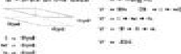
Figure 1. A diagram illustrating the relationship between the input and output of the proposed algorithm. The input is a 2D image, which is processed by the proposed algorithm to produce a 2D image. The output is a 2D image, which is then processed by the proposed algorithm to produce a 2D image. The output is a 2D image, which is then processed by the proposed algorithm to produce a 2D image.