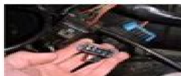
Figure 3 Close up of the 10-pin ALDL plug in a Nova engine bay.