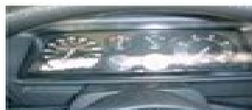
Figure 4 ECU warning lamp on the dash board.