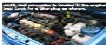
Figure 2 Location of the 10-pin ALDL plug in a Nova engine bay.