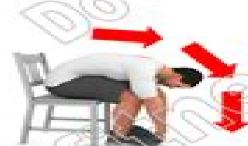
GLUTES & LOW BACK