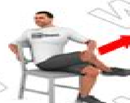
GLUTES & ABDUCTORS

• Hold each stretch for 15-30 sec • Stretch slowly • Stop if you feel pain