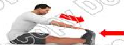
HAMSTRINGS & LOW BACK