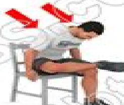
GLUTES & ABDUCTORS