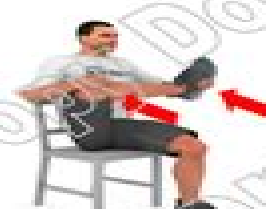
GLUTES & ABDUCTORS