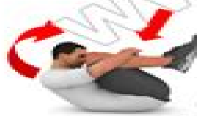
HAMSTRINGS & LOW BACK