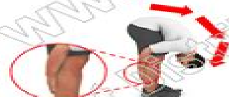
HAMSTRINGS & LOW BACK