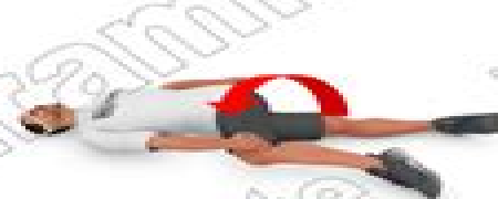
GLUTES & ABDUCTORS