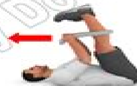
HAMSTRINGS & LOW BACK