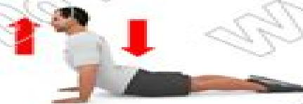
ABDOMINAL & HIP FLEXORS

Consult a physician before starting any stretching regime. This chart is for informational purposes only.