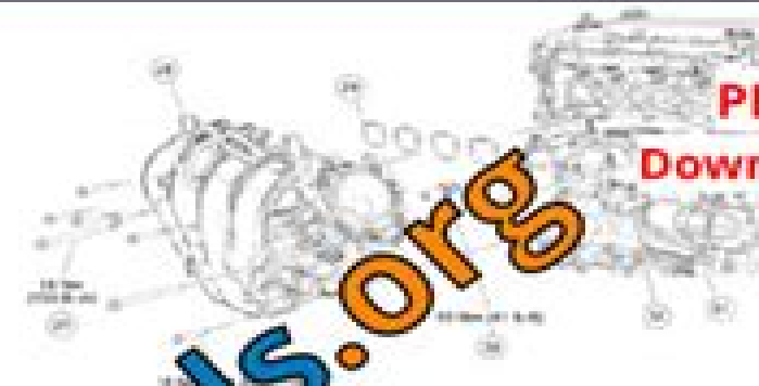
Fig. 4: Identifying Tightening Sequence Of Lower Intake Manifold Bolts Courtesy of FORD MOTOR CO.