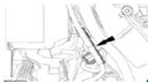
Fig. 10: Locating Electrical Connector Pin-Type Retainer

Detach the electrical connector pin-type retainer.