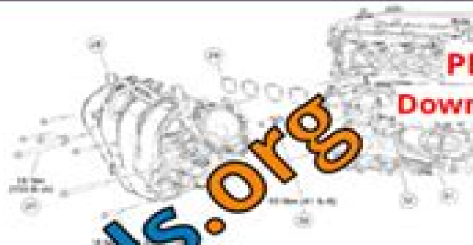
Fig. 4: Identifying Tightening Sequence Of Lower Intake Manifold Bolts