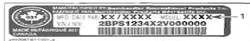
1. Model number

The Vehicle Model Number is scribed on vehicle description decal.