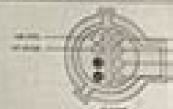
SPEED CONTROL SERVO