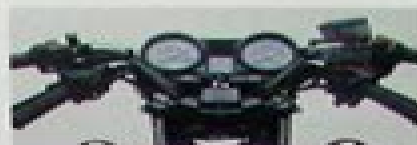
Independently adjustable handlebars designed for the rider's comfort and control. The Night Hawk's instrument cluster is also adjustable.

story. This engine also has a reputation for reliability. The result of over a decade of building and testing four-cylinder engines. It features a maintenance-free transmission and ignition and its overall design makes it easy to work on.