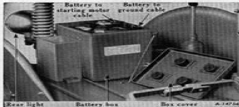
Illustr. 62—Battery and Cables.

When tractors equipped with electric starting and lighting are shipped from the factory, the battery ground cable is disconnected. In addition, the "generator field to switch cable" (Ref. No. 10, Illustr. 64) is disconnected at the light switch. Therefore, before attempting to start the tractor, be sure that both cables are connected to their correct terminals.