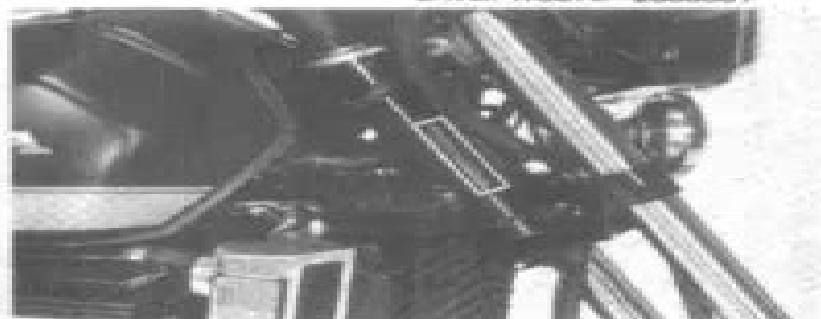
The frame serial number is stamped on the steering head right side.