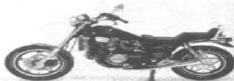
V45 MAGNA BEGINNING F NO. RC071 - CM000001 E NO. RC07E - 4000001