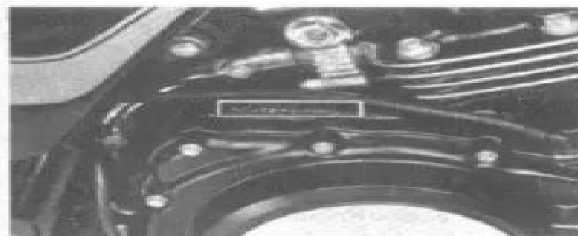
The engine serial number is stamped on top of the right crankcase.