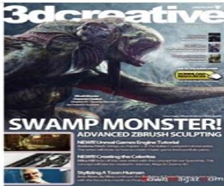
3DCreative Issue 063 - November 2010 English | PDF | 91 pages | 11,9 MB

3DCreative - the November 2010 issue of creative magazine about world 3D-art. It is to that for teams at professionals of the business. Here is both 3Ds Max, Maya, and ZBrush.