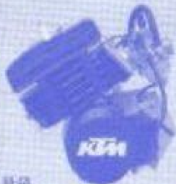
65-02 650 650 ADVANTURE 650