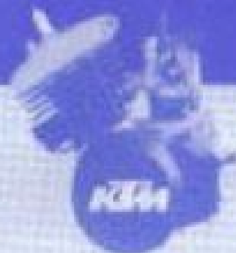
65-01 650 650 ADVANTURE 650