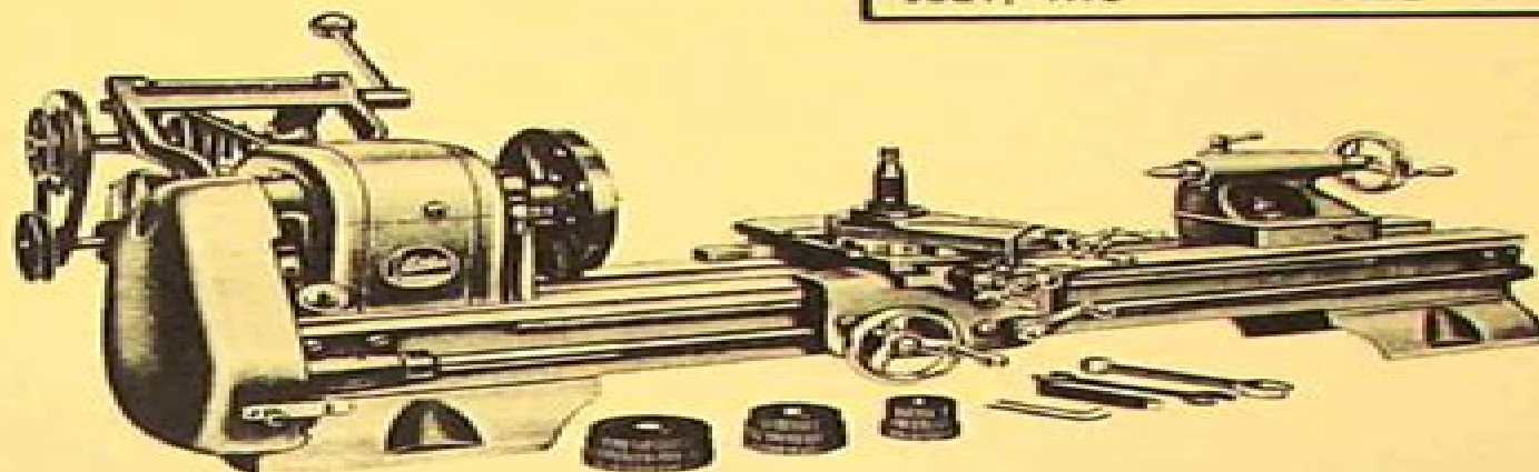
NO. 618 BENCH LATHE