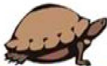
Turtles & Tortoises