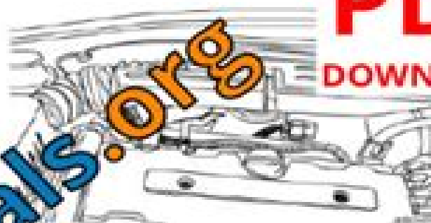
Fig. 30: Identifying Breather Tube To Camshaft Cover (1 Of 2)