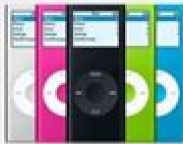
2G iPod nano