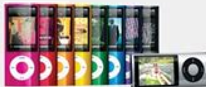
5G iPod nano