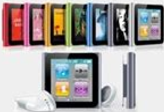
6G iPod nano