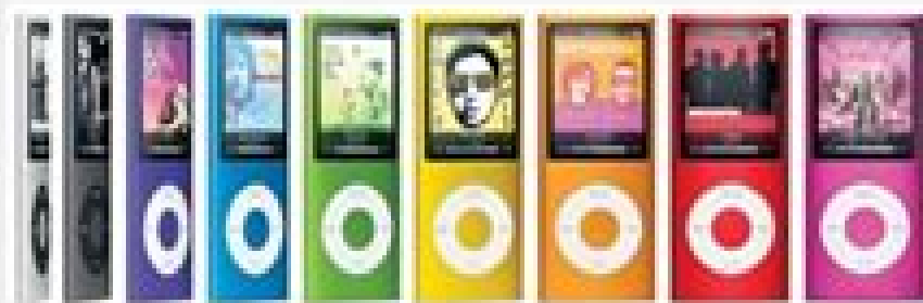
4G iPod nano