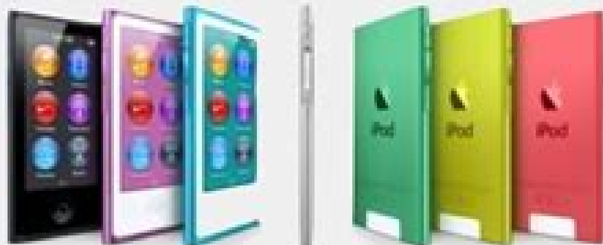
New iPod nano