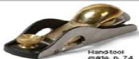
Hand-tool guide, p. 74