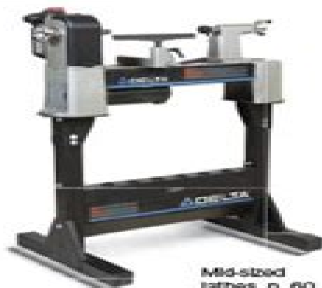
Mid-sized lathes, p. 60