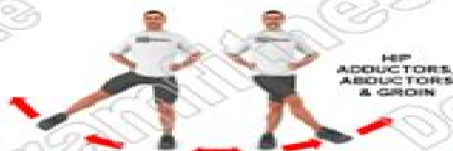
HIP ADDUCTORS, ABDUCTORS & GROIN