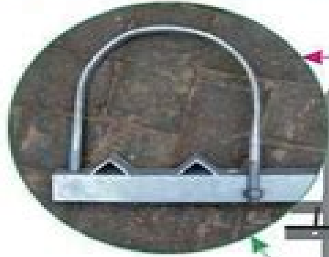
Galvanized metal hoop

In addition, a low-voltage lightning arrester must be installed in the low-voltage side distribution box of the distribution transformer to prevent the intrusion of low-voltage reverse conversion waves and low-voltage side lightning waves, and protect the distribution transformer and its total metering device.