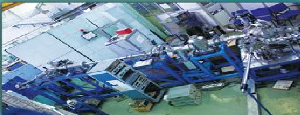
Photoelectron spectroscopy beamline