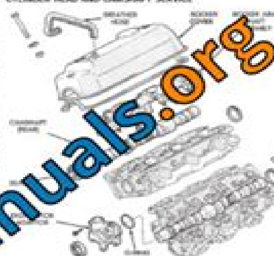
Fig. 1 Cylinder Head/Camshaft Valves