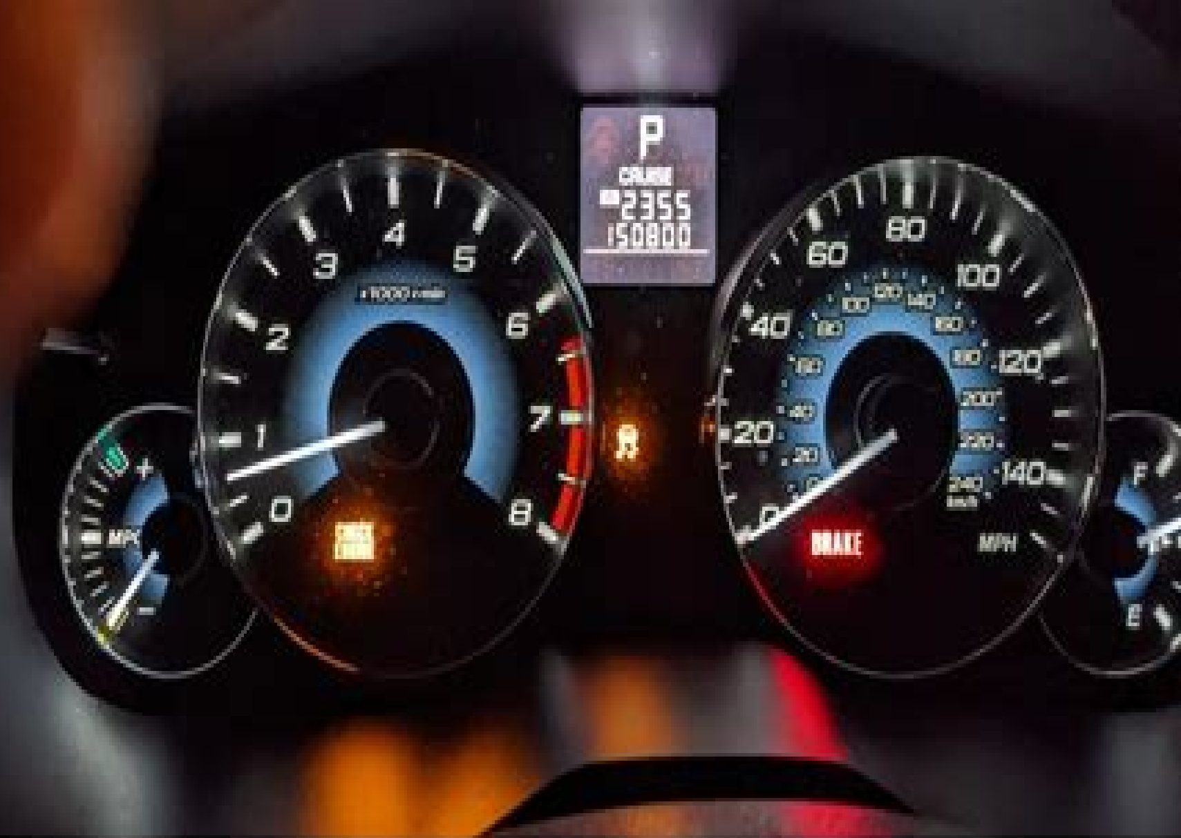
Multiple Warning Lights On Dash Subaru Outback