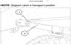
Attachment and coupling location