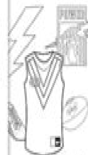
Port Adelaide Power