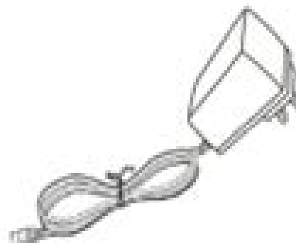
1 x 5V Power Adapter