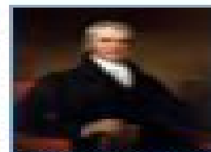
Chief Justice John Marshall reinforced the Federalist legacy until the 1830s.

Jefferson was never able to gain control of the federal judiciary, whose unelected members served life terms. John Marshall , a Federalist who was nominated as chief justice by John Adams, exercised considerable influence over the judiciary. In Marbury v. Madison (1803), Marshall declared that the Supreme Court had the power of judicial review, allowing it to strike down laws that conflicted with the Constitution. The McCulloch v. Maryland (1819) decision upheld the constitutionality of the national bank, strengthening the power of the federal government.