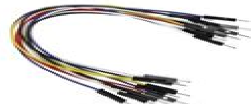
Figure 3: Jumper Wires