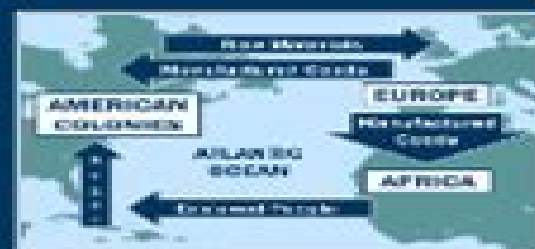
A map showing common Transatlantic trade routes during the colonial period.

In the 1650s, the British Parliament passed the Navigation Acts to regulate colonial trade and discourage British colonies from importing goods from foreign ports. Government regulation of trade to limit imports is known as mercantilism . However, the British government did not strictly enforce the Navigation Acts. This policy of nonenforcement is known as salutary neglect .