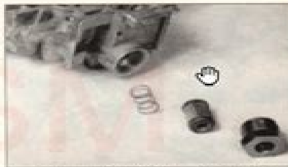
8.3e Removing the fuel inlet nut, fuel filter and spring