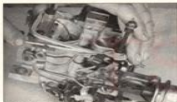
8.3d Remove the gasket from the top of the air horn