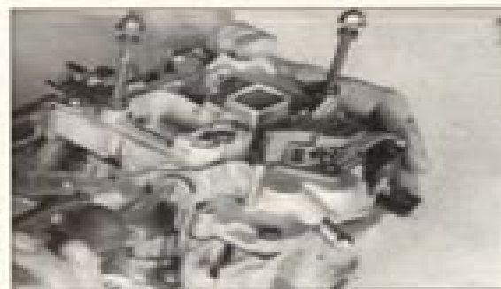
8.3f Remove the pump lever attaching screw