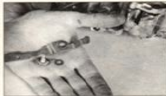
8.3g Disconnect the pump rod from the pump lever and remove the pump lever