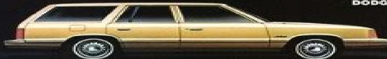
DODGE ARIES-K WAGON