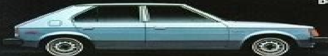
DODGE OMNI MISER