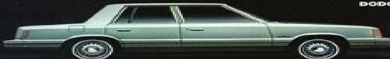
DODGE ARIES-K SEDAN