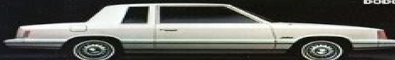
DODGE ARIES-K COUPE