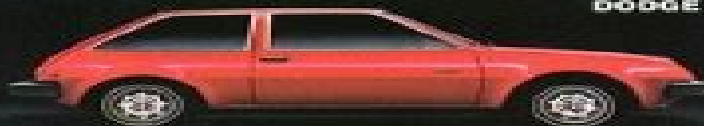
DODGE COLT HATCHBACK