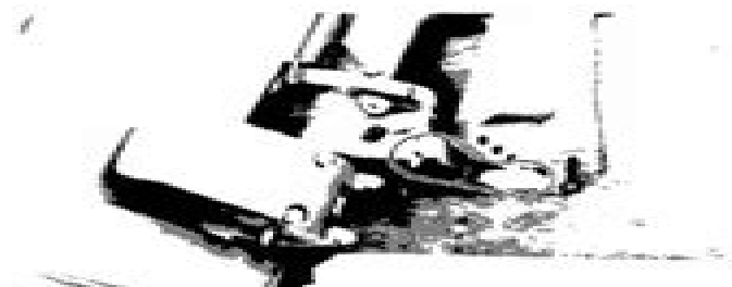
1. Set position