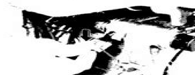
1. Tilt lever