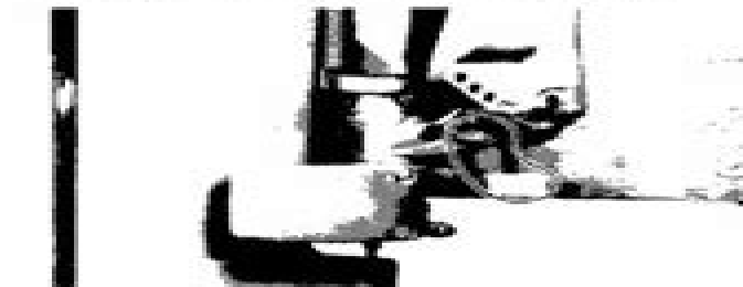
1. Normal position

This system allows cruising in shallows by inclining the outboard motor 20 degrees, although previously this was not possible.