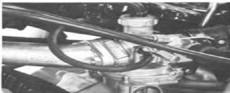
The carburetor identification number is on the left side of the carburetor body left side.