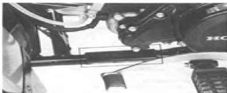
The frame serial number is stamped on the frame left side.