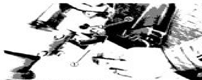
1. Shallow water drive lever