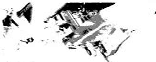
1. Tilt rod