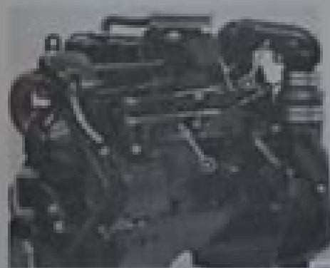
1. Serial Number Plate 2. Serial Number