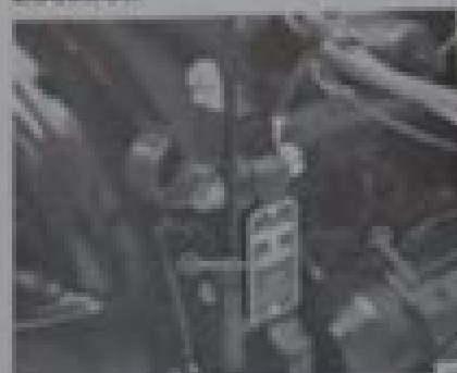
1. Serial Number Plate 2. Serial Number