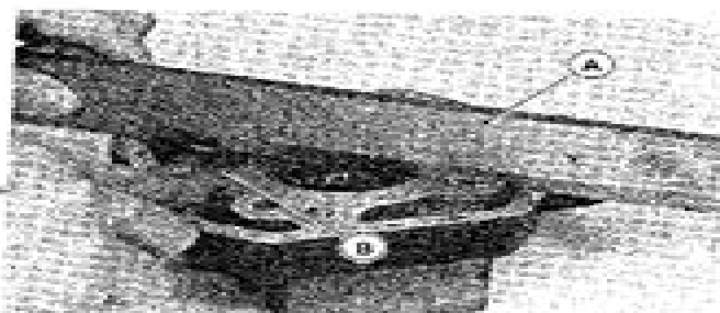
A. Straightedge B. Thickness Gauge