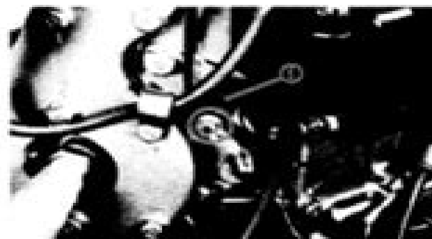
1. Knock sensor