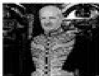
Representative of the Great Medicine Reservoir

Here is page 1 to give you writing. Begin writing your news article on page 2.