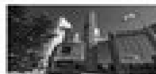
Great Medicine Reservoir Centre

→ To celebrate the opening of the reservoir centre and to have news about 17th Great Medicine