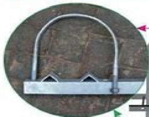
Galvanized metal hoop

In addition, a low-voltage lightning arrester must be installed in the low-voltage side distribution box of the distribution transformer to prevent the intrusion of low-voltage reverse conversion waves and low-voltage side lightning waves, and protect the distribution transformer and its total metering device.