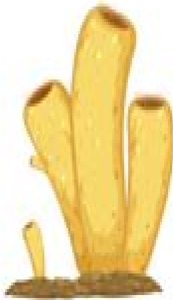
No Symmetry (eg. Porifera)